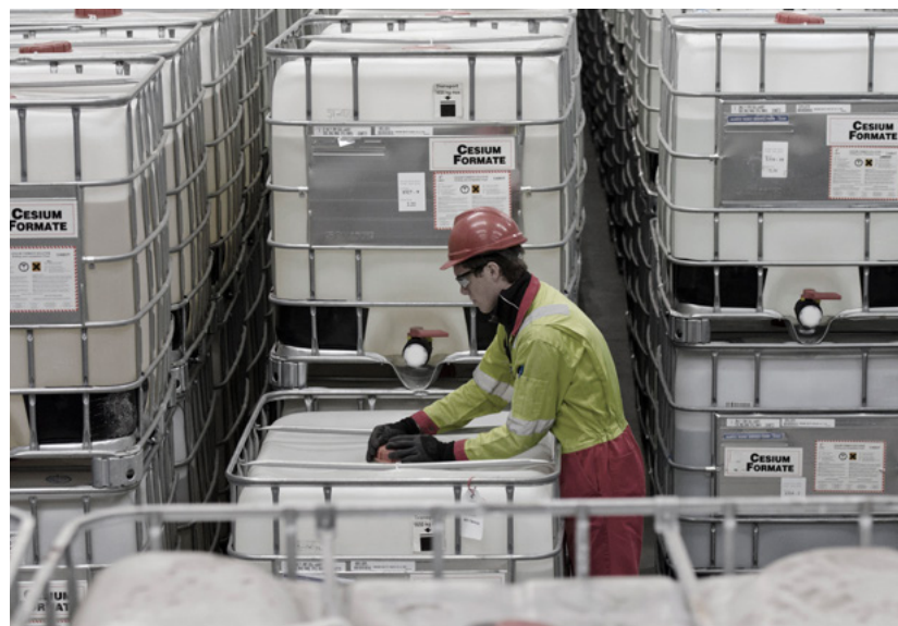
The comfortable choice – personnel using cesium formate brine only require standard personal protective equipment to handle the fluid.