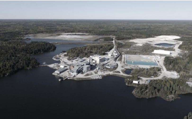
Cesium formate brine up to 2.30 g/cm 3 (19.2 lb/gal) is produced at our mine in Canada.

Sodium, potassium and cesium formate are naturally occurring organic salts. When diluted with water these highly soluble substances form high-density, alkaline brines for drilling, completion, workover and intervention operations. Cesium formate brine is the heaviest with solids-free densities between 1.57 g/cm 3 (13.1 lb/gal) and 2.30 g/cm 3 (19.2 lb/gal).